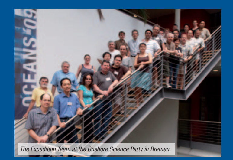
19 ka - Meltwater Pulse, and Meltwater Pulses 1A, 1B, as well as existing time intervals before the LGM. During the Onshore Science Party at the IODP Bremen Core Repository, high-quality coral samples, consistent with shallow, high-energy settings,

Preliminary U/Th- and AMS C14-derived chronology confirms that the recovered cores span the period of interest since the LGM, including comprehensive new coverage of crucial periods in Earth's sea-level and climate history e.g. , MIS3, MIS2 (LGM),