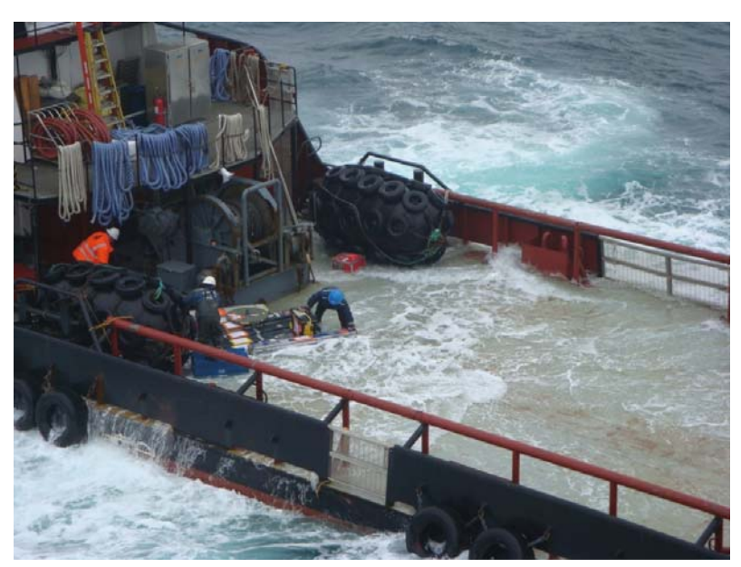
G Mountain©ECORD IODP

The strangest feeling is that of being entirely cut off when surrounded by a thick fog bank – often we haven't been able to see the sea from the deck of the platform....and you know it's only 20 m away! And then Greg, one of our Co-chiefs had a very entertaining ride out and transfer onto the platform, as the sea swell threatened to not only get the feet of personnel "damp" – an understatement if ever I heard one, but also float pieces of equipment places they shouldn't be.