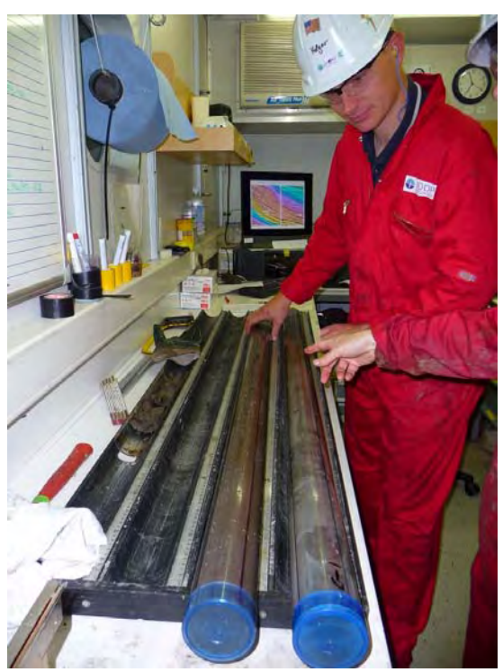
Any metal core catcher pieces are identified in core curation, as they may affect MSCL measurements

I then carry the 1.5 meter stick of core to the scanning bench and start the scanning process.