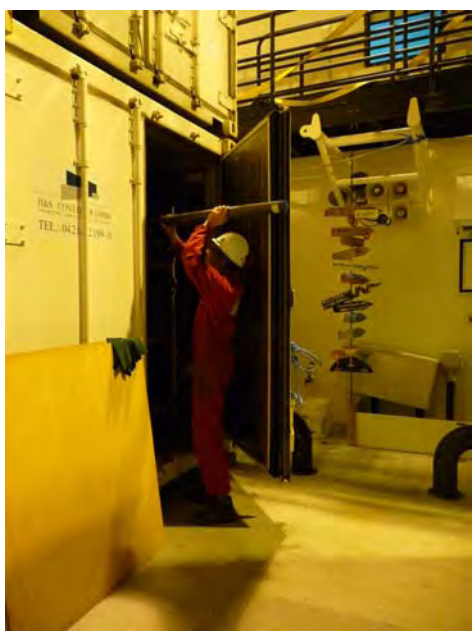
The core now goes into the reefer to cool before MSCL measurements are taken

If we want data from core scanning we need a deeper understanding of why there is no signal with this drill fluid. We look carefully at it with a microscope. Then we see it – the drill fluid is filled with tiny air bubbles. It seems likely that the air bubbles absorb the pressure wave that we are trying to send through the core. We again test this hypothesis by taking a core from the cold storage container that has been sitting for 24 hours. Our notes tell us that the drill fluid was milky white before but now is a bit clearer. There are no bubbles in the fluid any more and we get good data readings. We now understand our troubles in getting to our scientific goal.