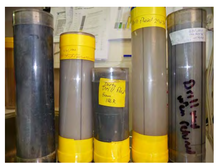
Different drill fluid mixes have their physical properties measured as baselines

We can't go on like this? In going over my notes I find that the drill fluid was watery before, but now has changed to a milky gel like substance. One hypothesis could be that the change in the drill fluid could be the cause. We need to test it. So we ask the drillers for a sample of the drill fluid. Could this be the explanation? We place the sample on the scanner and wait for the results. No signal. So our initial hypothesis was right. But what now?