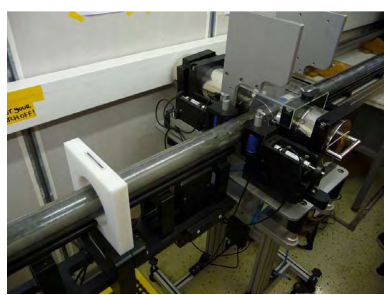
Multi-sensor Core Logger (MSCL)

I then carry the 1.5 meter stick of core to the scanning bench and start the scanning process.