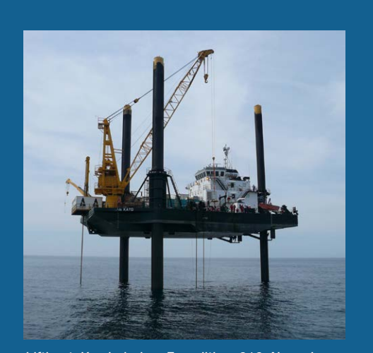
Liftboat Kayd during Expedition 313 New Jersey Shallow Shelf.