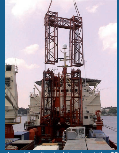
Assembling the derrick onboard the DF Hunter - Exp 310 Tahiti Sea Level.

during an Onshore Science Party (OSP), hosted by the IODP Bremen Core Repository and MARUM - Center for Marine Environmental Sciences, University of Bremen, Germany. Each MSP therefore comprises two distinct phases.