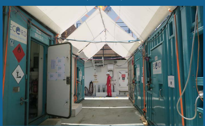
'Main street' between ESO mobile containers aboard Liftboat Myrtle - Exp 364 Chicxulub K-Pg Impact Crater.