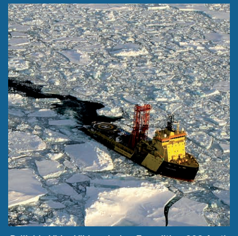
Drillship Vidar Viking during Expedition 302 Arctic Coring (ACEX).