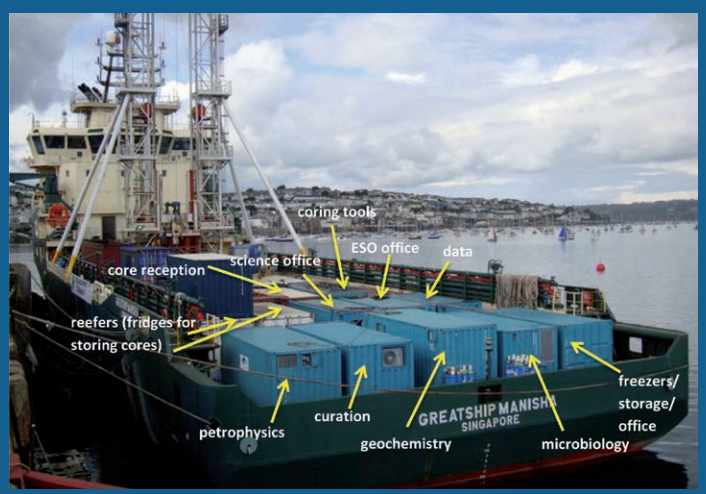
Mobile containers aboard the Greaship Manisha - Exp 347 Baltic Sea Paleoenvironment.

facilities. The limited space onboard dictates that the emphasis offshore is on acquiring the cores and conducting any ephemeral measurements. The un-split cores are then shipped back to the IODP Bremen Core Repository for the OSP. Consequently, only a few researchers and technicians, under the guidance of the Co-chief Scientists, are required during the offshore phase, with the whole Science Party convening at the OSP.