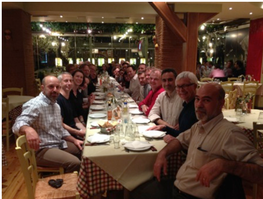
Meeting participants enjoying the conference dinner.