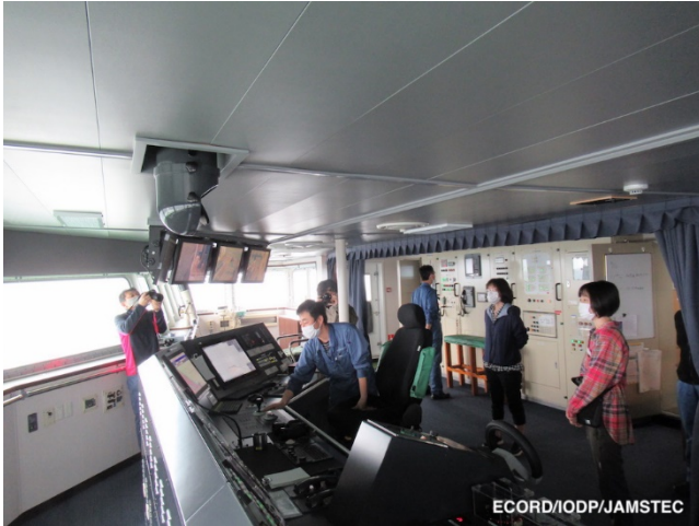
Scene of ship tour at Bridge