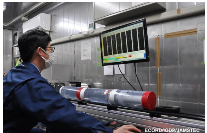
MSCL calibration check