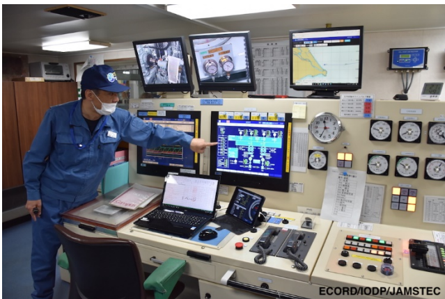
Tour of engine control room