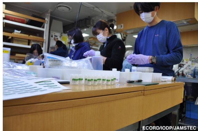
4) All hands of science team put the labels on each vial