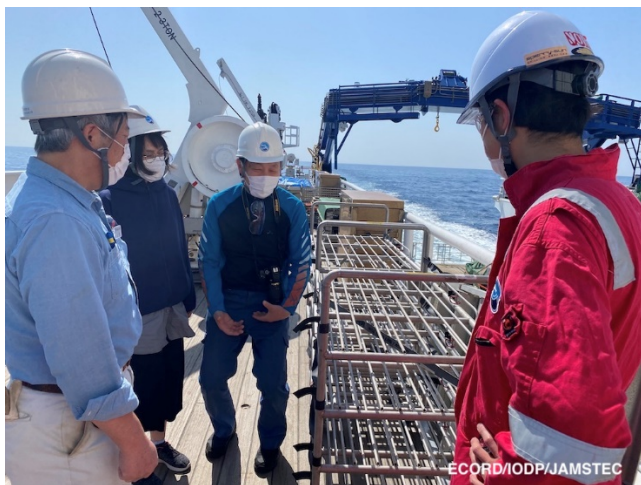
1) Science party checking work spaces and paths of GPC cutting on A-deck