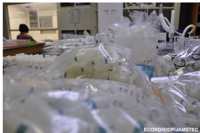
5) Labeled vials