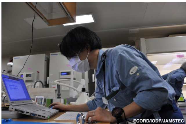
2) Curatorial staff making labels for IW/BW vials