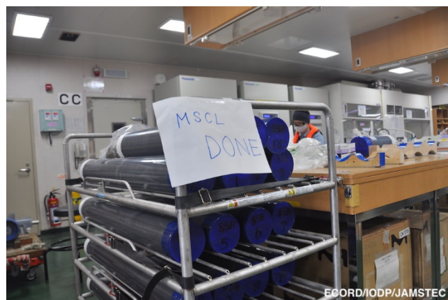
7) MSCL scanning completed