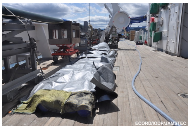
2) 5 m segments waiting for cutting into sections under UV-cut sheet