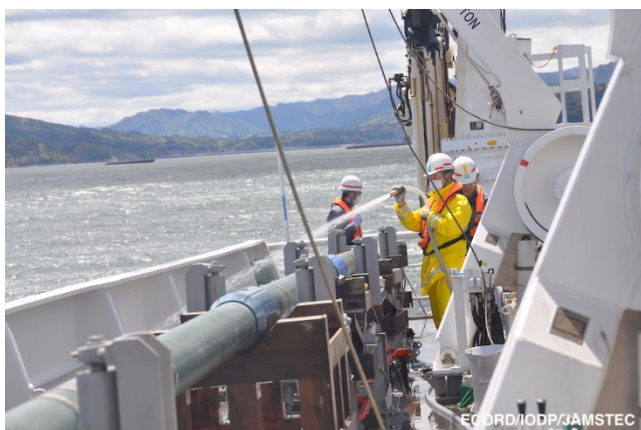
6) GPC operation team washing the mud off the assembly