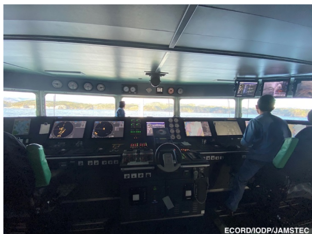
1) On the Bridge in the morning, off Miyako