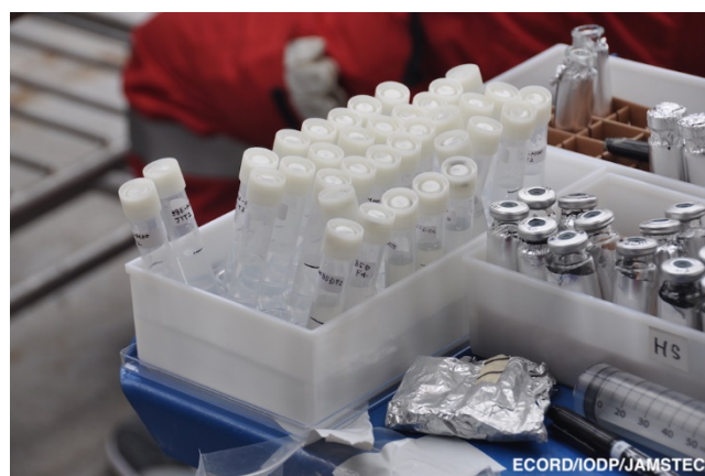
5) Sample tubes for microbiological study in the sampling area