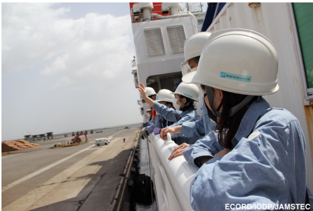
1) Starting the next phase of the expedition