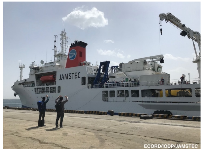
3) Bon Voyage!