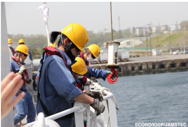
2) Let go mooring!