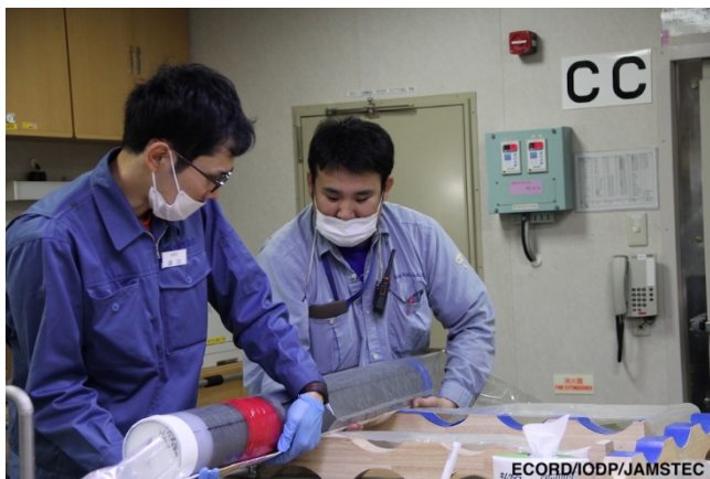
2) Lab tech placing core into an ESCAL bag