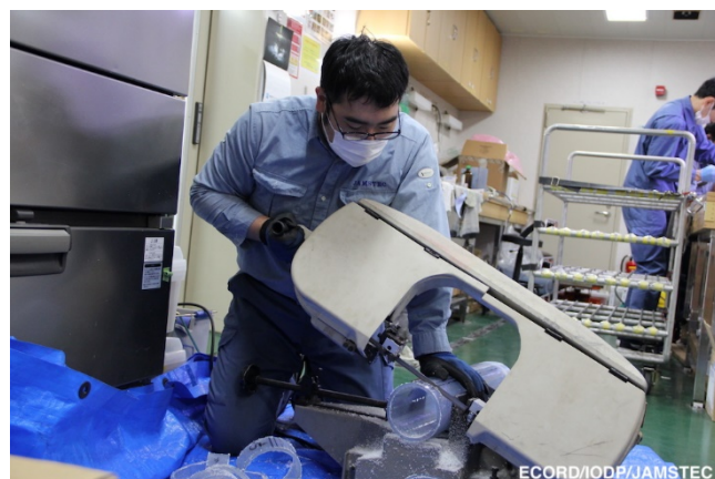
6) A lab tech making liner patches