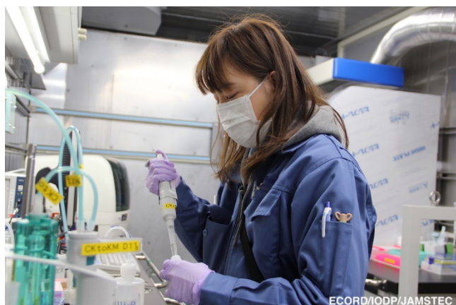
7) A lab tech pipetting IW for analysis