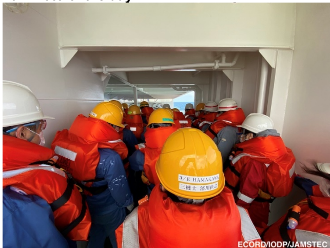
1) Ship's drill