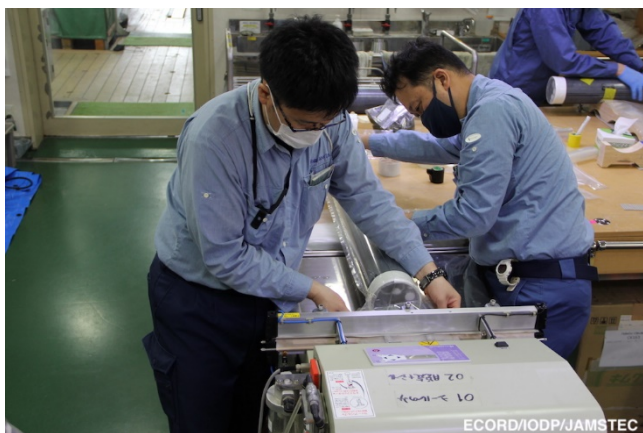
3) Lab tech purging, vacuuming and sealing ESCAL bag