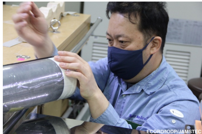
4) A lab tech folding up the edge of ESCAL bag