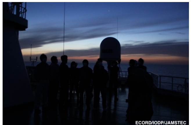
5) Waiting for a lunar eclipse