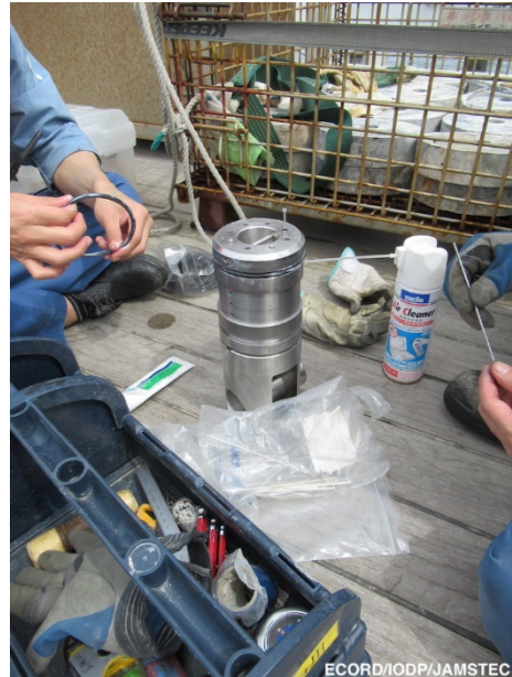
4) Maintenance of the piston of the GPC