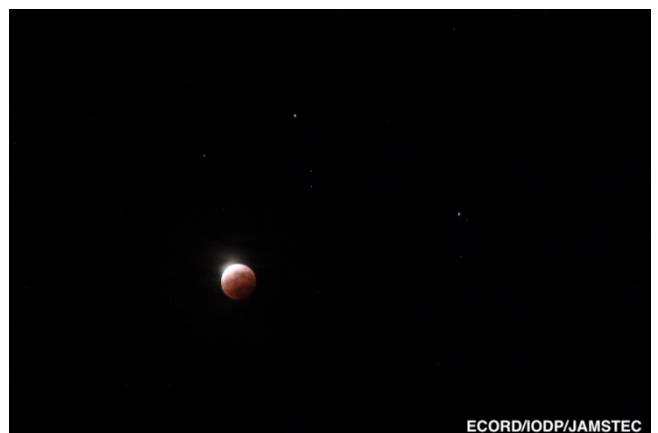
6) The lunar eclipse