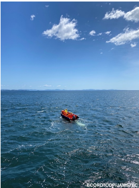
2) A work boat going to port