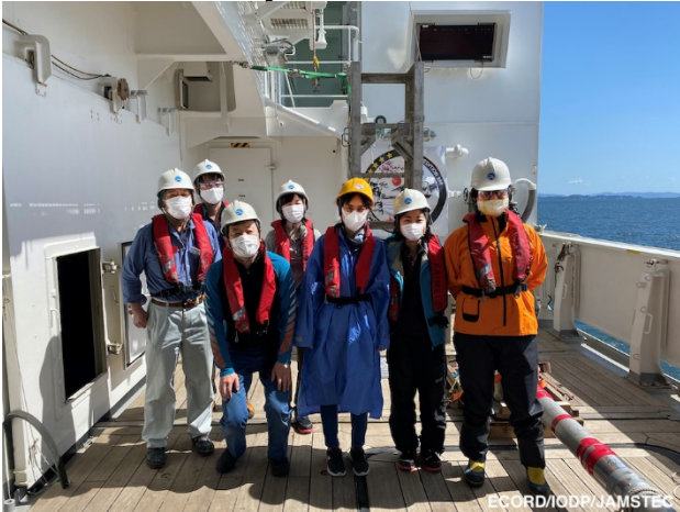
1) Group photo of the offshore science party