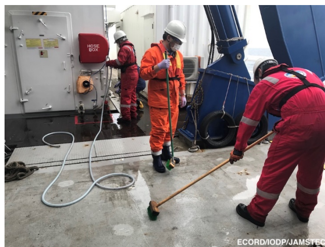
4) Washing the deck after core cutting