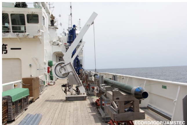
2) The 30 m GPC assembly recovered to deck