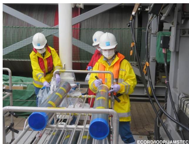
3) Lab technician helping to sample from each section bottom end