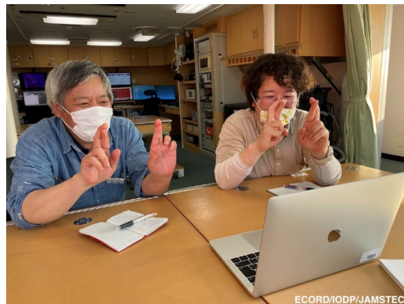
2) Fingers crossed for the last GPC operation