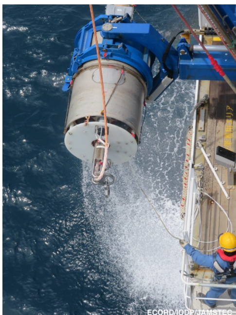
3) GPC weighthead splashing seawater when recovered