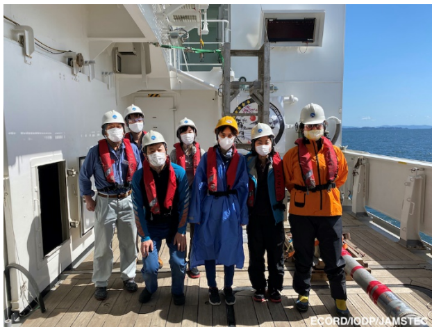
1) Group photo of the offshore science party