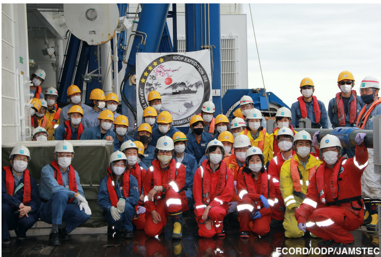
4) The Expedition 386 Offshore Team