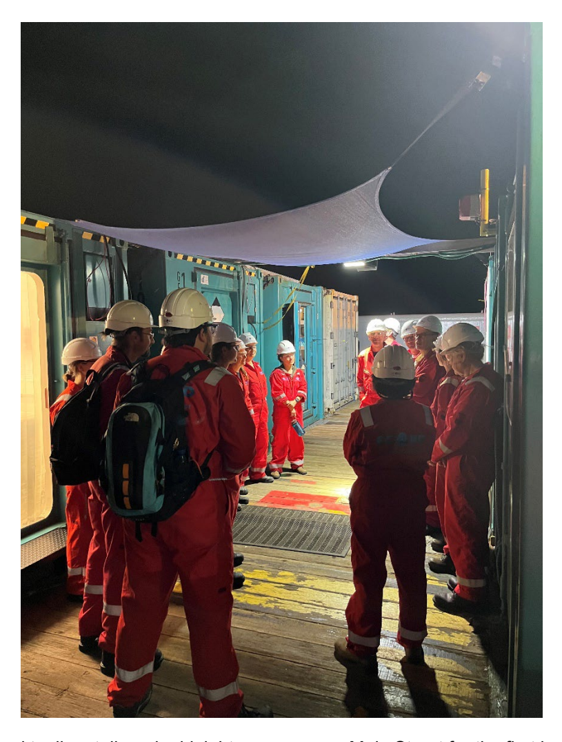
Final toolbox talk and midnight crossover on Main Street for the first leg of Expedition 389.