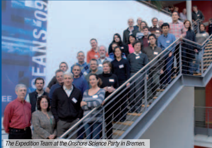
The Expedition Team at the Onshore Science Party in Bremen.

During the 12-week long offshore phase of the expedition and the Onshore Science Party held at the Bremen Core Repository in November-December 2009, the scientists analysed the cores to accurately reconstruct global sea-level changes during the period 14-24 million years ago and to assess the imprint of those changes on the development of the sedimentary sequences off New Jersey.