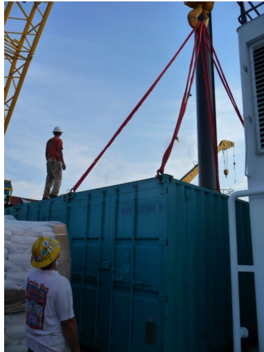
Rigging the containers up for lifting off