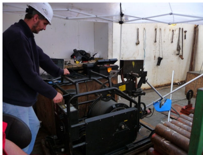
Denis still logging until the end!