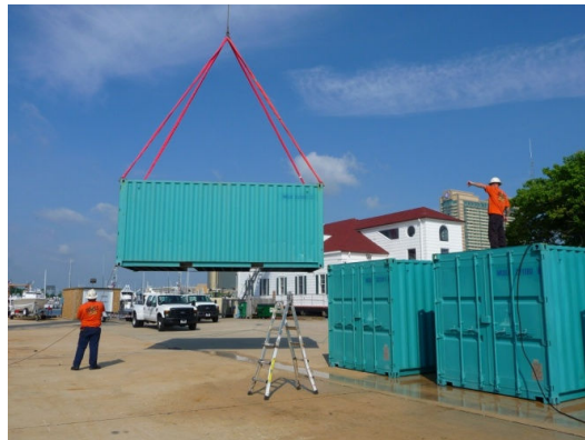
A wash and a scrub before their journey onwards to Europe

So things are still all go even at “The End”!!