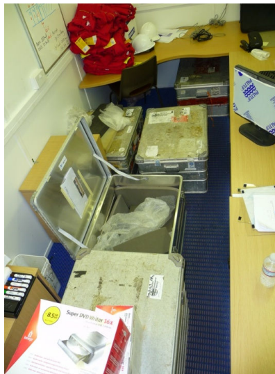
C_Cotterill@ECORD_IODP_The science container becomes a packing room

Computers were put away securely, walls were stripped of documents, notes and photos, flooring and banners were cleaned, generators were moved, pallets on top of the containers were secured, network cables were taken down, and the Drilling Information System (DIS) was closed down.....and yet on the drill floor the logging engineers were still hard at work collecting as much data as we could right to the very end.