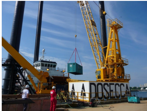
On their way to the quayside