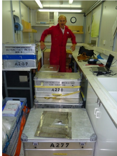
C_Cotterill@ECORD_IODP_Holger boxes himself into a corner in core curation

We began to ready ourselves for this transit a few days ago. As the last of the core, brought up on deck at 1820 on July 11 th , made its way through each container – core curation, geochemistry, science and MSCL, the containers were de-mobilised.