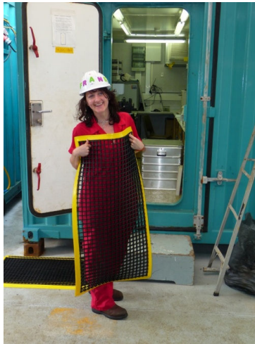
Sally models some newly cleaned non-slip matting