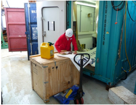
Washing the banner down