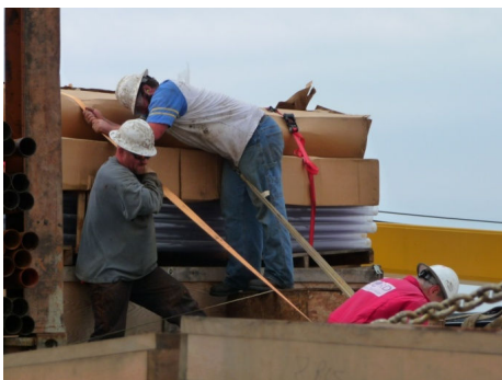
The drillers tie down everything on top of the containers prior to transit