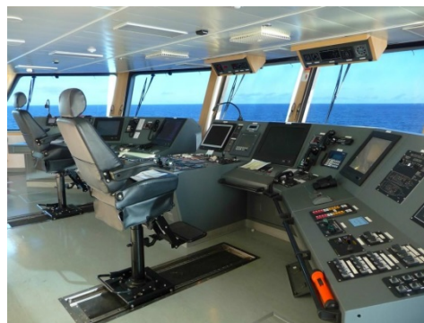
CarolCotterill@ECORD_IODP: 1.View of the forward facing bridge used when in transit. View of the aft facing bridge used when coring operations are taking place

Anyway, enough for now and look in for the next update on what we are doing, why we are doing it and how we are doing it!