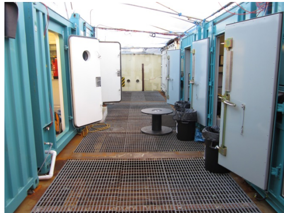
View of containers in the 'Science Garden'

Whilst we are busy down on the main deck and drill floor, the vessel's Dynamic Positioning (DP) system, other shipping traffic and weather conditions – in fact anything that might affect our coring operations – are monitored from the bridge.