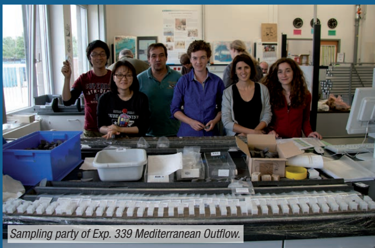
Sampling party of Exp. 339 Mediterranean Outflow.

The BCR was established in 1994 and now stores 154 km of cores acquired during 89 expeditions. Approximately 200 scientists visit the repository annually, sometimes working on the cores in week-long sampling meetings. As many as 70,000 samples per year are taken by visiting scientists and the repository staff. In its 22 years of operation, more than 950,000 samples representing almost 4,300 individual requests have been taken and distributed worldwide.