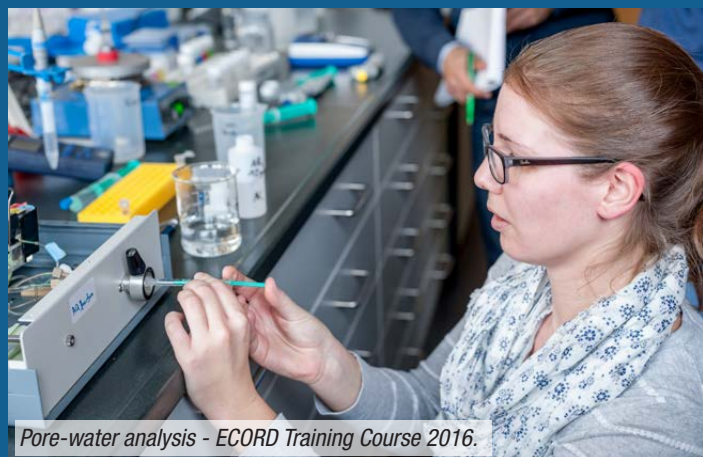
Pore-water analysis - ECORD Training Course 2016.

The 5-day ECORD Training Courses focus on the IODP core-flow procedures to prepare the participants for IODP expeditions and instill them with an appreciation for high standards in all kinds of coring projects.