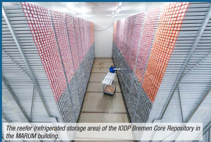
The reefer (refrigerated storage area) of the IODP Bremen Core Repository in the MARUM building.

The IODP Bremen Core Repository (BCR) at the MARUM, Center for Marine Environmental Sciences at the University of Bremen, is one of three core repository facilities worldwide. The BCR has state-of-the-art laboratory and office facilities and a large refrigerated storage area with a movable rack system. The repository provides services to the international community through advanced curation and sampling techniques, database archiving (Drilling Information System, DIS), and participates in a wide range of education and outreach activities.