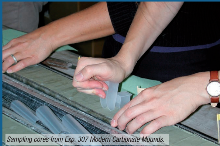
Sampling cores from Exp. 307 Modern Carbonate Mounds.

With almost 3,500 visitors from all over the world so far, the repository is an important hub for IODP/ECORD, and the wider scientific community. The BCR significantly contributes to the exchange and transfer of marine science knowledge, leading to