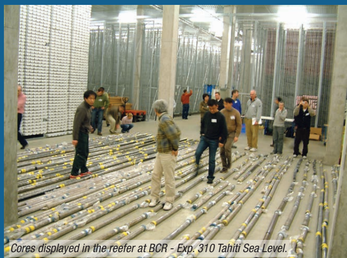
Cores displayed in the reefer at BCR - Exp. 310 Tahiti Sea Level.

In its role within the ECORD Science Operator (ESO) Consortium, the MARUM, University of Bremen is tasked with curating and archiving collected cores, as well as providing offshore (mobile laboratory containers) and onshore laboratory facilities for systematic core sampling and data gathering according to IODP measurement procedures. See ESO leaflet for further details.