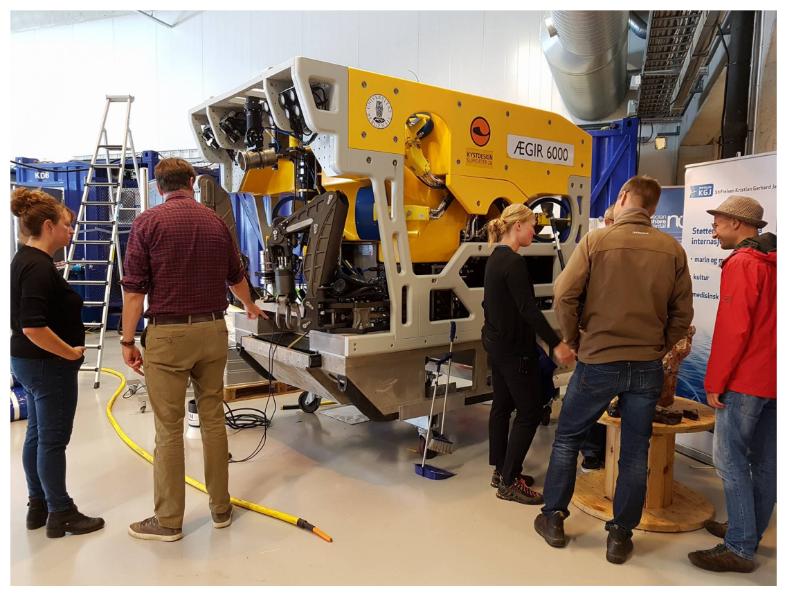
Fig. 2. Site visit to the Ocean Laboratory facility examining the Ægir 6000 ROV

A guided tour to the Norwegian Ocean Observation Laboratory facility provided workshop participants the opportunity to learn about the technological infrastructure that is available from the University of Bergen for surveying targets for the upcoming IODP proposal.