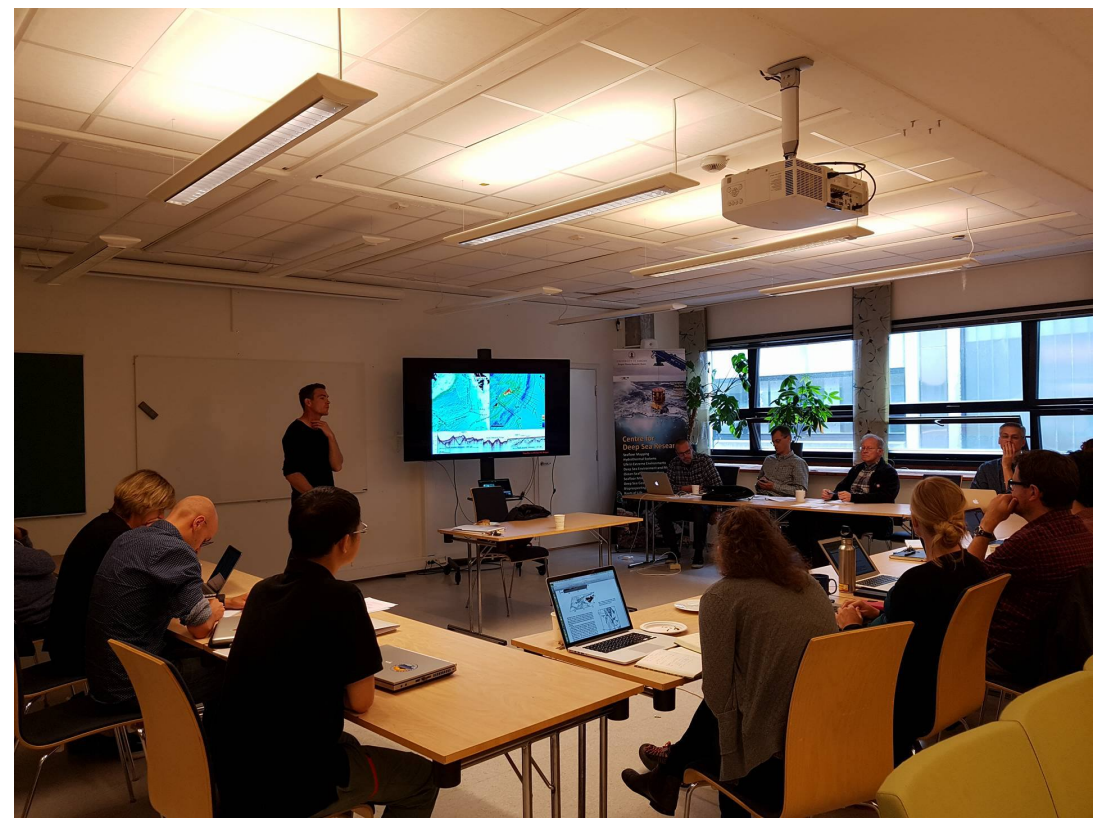
Fig. 1. Meeting facility at the K.G. Jebsen Center for Deep Sea Research.

The purpose of the proposed workshop was to bring together a team of scientists from multiple disciplines, ranging from geophysics to petrology to biogeochemistry and microbiology, to plan and draft up an IODP proposal for JR-style drilling of a series of holes on and off axis of the SKR to assess the cycling of carbon and consequences for life in sediments and shallow basement. The workshop consisted of participants with an extensive knowledge and experience in planning and leading previous IODP drilling expeditions, which along with the invaluable guidance from IODP assistant director of science services and manager of science operations, helped elucidating the operational constraints and acted as mentors for the younger and less experienced scientists.